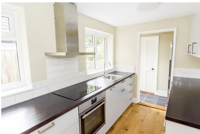
Kitchen 9'9 x 6'1 (2.97m x 1.85m)

Two UPVC double glazed windows to side aspect. Having a selection of fitted base and wall units with a solid wooden worktop over and a single bowl stainless steel sink. Single fan assisted electric oven, four ring electric hob and extractor over. Integrated dishwasher. Oak flooring.