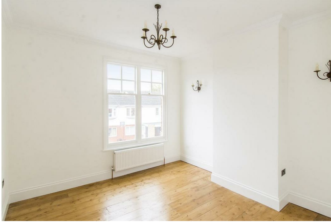
Bedroom One 12'0 x 11'4 (3.66m x 3.45m)

Timber framed sash-style double glazed window to front aspect. Exposed wooden flooring. Built-in wardrobe/cupboard. Radiator.