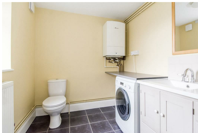
Utility Area/Downstairs WC 7'6 x 6'7 (2.29m x 2.01m)

UPVC double glazed window to side aspect. Tiled flooring. Bespoke ceramic sink unit with storage below. Low level WC. Worktop over space with plumbing for a freestanding washing machine with space for a further under counter electrical appliance. Boiler. Radiator.